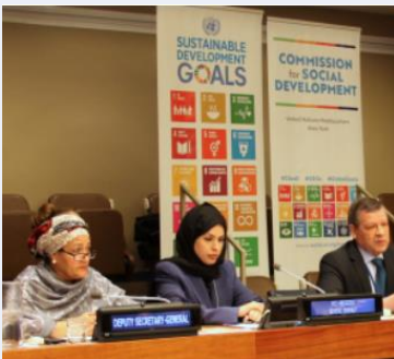
The 58. Commission for Social Development takes 11-21 February 2020 in New York

The International Federation for Home Economics proposes (...) policy recommendations to address feminized homelessness in the Global South. First, providing a voice to homeless women through qualitative inquiry. Second, introducing or expanding existing international economic policies to explicitly include resettlement, rehabilitation, restitution, and resolution requirements for investors participating in and enjoying the benefits of United Nations-affiliated credentials for sustainable asset management.