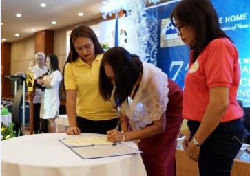
Members of the Manila Public Schools Home Economics Teachers Association

in Cagayan De Oro City, Philippines. The theme was “The Development of Home Economics and its Allied Discipline for the Aspiration of the People to Live a Better Life”. It was adapted to the theme of the 20 th Biennial International Congress of the Asian Regional Association for Home Economics (ARAHE) 2019 in China.